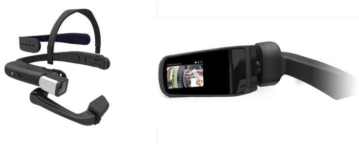
Fig. 1. A visualisation of the Head-Mounted Tablet 1 (right) and an illustration of the arm with the information given (left); copyright RealWear (2018)

their hands to be free for tasks. It has been developed for industrial use, which is why the 380g device can be combined with a safety helmet and safety goggles. This weight includes a 3250mAh battery with an 8-hour charge life. Active noise suppression of up to 90dB is designed to ensure reliable speech recognition even in noisy environments. Furthermore, the HMT-1 is waterproof, shockproof, dustproof, and can be used in temperatures from -20C to 50C. The colour microdisplay with a resolution of 854x480 pixels can be worn over the left or right eye (realwear.com). A unique feature of this technology is that the cognitive support (i.e., the information that is displayed) can be physically retrieved or folded away. Thus, the user has good control over the display technology in his or her field of view, and can fold it away before becoming distracted or annoyed by the displayed information.