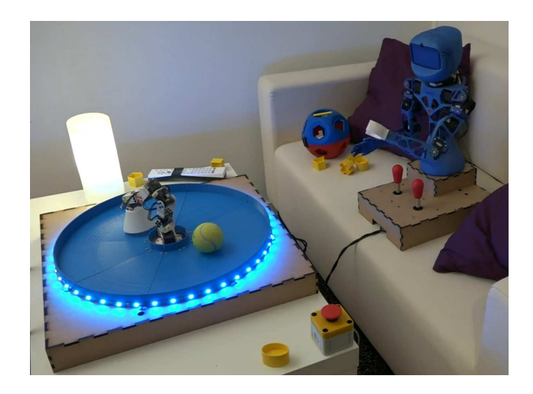
Figure 1. Curiosity-driven exploration through autonomous goal setting and self-organized curriculum learning in the experimental setup presented in [Forestier et al., 2017] (see video: https://www.youtube.com/watch?v=NOLAwD4ZTW0). Here a humanoid robot is surrounded by objects. The robot can learn to control some of them, while others are unlearnable distractors. Some objects can interact with each other, e.g. be used as tool to control other objects. The robot initially does not know which skills and objects are learnable, nor that objects may interact with each others. If an engineer would like the robot to learn how to move the ball forward by providing rewards only when the ball moves, then using classical reinforcement learning approaches would fail. Indeed, RL approaches combine hill-climing mechanisms that require observations of non-zero reward to improve the current solution, and rely on random exploration otherwise. Here, the time required by random exploration to enable the robot to find such a rare reward would be prohibitively long. The robot initially has no idea where to look for cues to solve this task. Indeed, moving the ball entails moving the white electric crane toy, which can only be moved by pushing one of the two joysticks, which can itself only be moved by appropriate movements of the hand, requiring specific sequences of motor commands in the joints. A more efficient approach is to use curiosity-driven exploration, where one lets the robot self-generate its own goals for controlling various objects, and spend time on the ones which produce maximal learning progress. The internal generation of goals, and the focus on goals providing maximal learning progress, model a form of curiosity. Doing so, the robot will first focus on playing with its hand, which is initially providing maximal learning progress. Then, it will discover as a side effect how to move the joysticks. In turn, due to the physical couplings in the environment, focusing on learning about the joysticks makes the robot discover how to move the crane toy and the ball in a few hours.