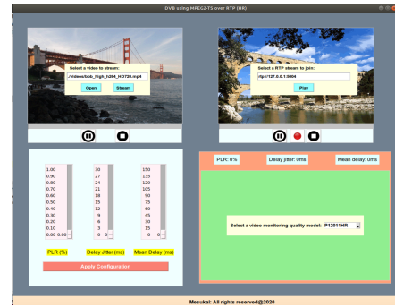
Fig. 2. A controlled streaming experiment

This operation relies essentially on Tshark . Our preliminary inspection shows that the PAL QoE model achieves reasonably good results, but we believe that more profound experiments are needed for a better judgment.