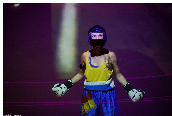
Figure 4. Deep Blue's with her HMS

The practice with this technology allowed us to experience how a digital medium can shape the way in which we perceive reality at a very sensorial level. We experienced how human embodied cognition is flexible and enactive allowing performers to reorganise their sensorimotor patterns in order to adapt themselves to the new digital and sensorial environment. Within this framework, the digital medium appears to be a "perceptual imperative" that informs, affects and designs our own reality.