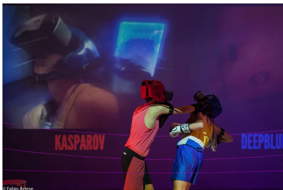
Figure 1. One of the "boxing scene"

Mutual gaze is the human basic form of connection, often very emotional, and is lived by both characters as a risky form of exposure that they must avoid. Every day the two players wear a sort of VR (Virtual Reality) headsets, with a rule set by the Platform. What they see through the headsets is the real time camera streaming of their smartphones. During the show, the curiosity of transgressing the rules slowly emerges: Deep Blue starts to desire to look into Kasparov's eyes, and this brings a lot of trouble for both of them. Indeed, in this automated daily life, unpredictable events allow the characters to approach and meet. The final scene is a sort of concert-dance that celebrates the desire for humanity, and the need for a real exchange of looks, of feelings, which leads to a hijacking of the machine itself.