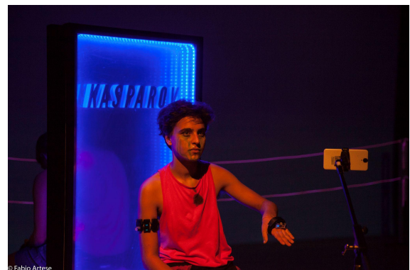
Figure 3. Kasparov "free time scene"

Additionally, a Microsoft Kinect v2 is used to calculate the quantity of motion [2] expressed by the performers' movement. For each scene we developed a specific mapping and sonification setting. The majority of the interactions are based on a combination of direct mapping strategies (one-to-one, one-to-many, many-to-one [17]) while in the Ondina "free time" scene more sophisticated machine learning techniques are employed. To this purpose a customized algorithm based on Ircam's Mubu library [5] is designed within the Max/MSP environment. Through the machine learning algorithms, some gestures can be learned and codified, therefore allowing the performer to trigger specific auditory and visual icons. Machine learning techniques have been developed to deepen the idea of self-branding. During the creation of the performance, Ondina created her personal set of gestures that have been learned by the machine. Similarly, she decided the type of audio and visual contents associated with her gestures. As such, the performer created her personal "brand" that can be recognisable by the Platform audience.