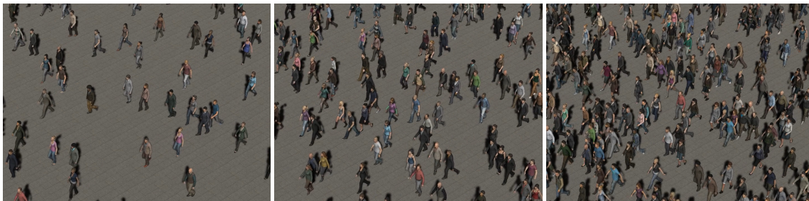
Figure 1: Examples of virtual crowds stimuli: (left) 250 characters animated with 1 female and 1 male motion, (centre) 500 characters animated with 25 female and 25 male synthetic motions, (right) 1000 characters animated with 500 female and 500 male synthetic motions (i.e. a unique motion per character).

Ludovic Hoyet ludovic.hoyet@inria.fr Inria, Univ Rennes, CNRS, IRISA Rennes, France