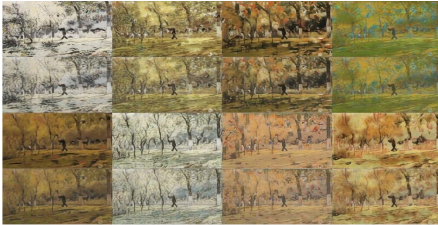
Fig. 3. Synthetic results of nature photos and famous Chinese paintings

In addition, since the evaluation criteria of the synthesized results are subjective evaluations, 10 different people were found to conduct subjective evaluations on the result shown in Figure 3. in this experiment. The evaluation results are shown in Table 1. It can be seen that the method in this paper has certain optimization effect on the synthesis result of Chinese painting as a style image.