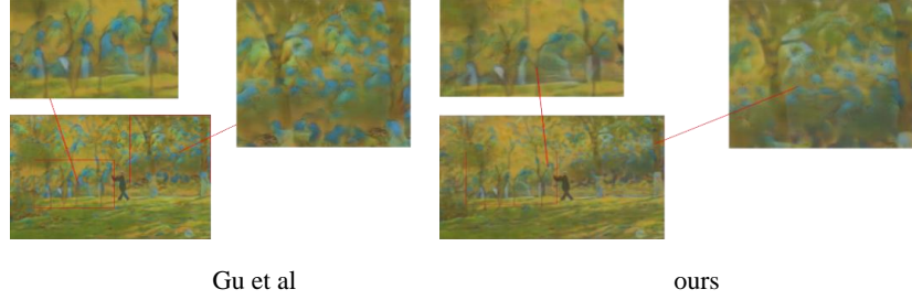
Fig. 2. Synthetic results of nature photos and Thousand Miles of Rivers and Mountains

In addition, since the evaluation criteria of the synthesized results are subjective evaluations, 10 different people were found to conduct subjective evaluations on the result shown in Figure 3. in this experiment. The evaluation results are shown in Table 1. It can be seen that the method in this paper has certain optimization effect on the synthesis result of Chinese painting as a style image.