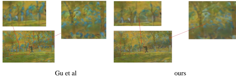
Fig. 2. Synthetic results of nature photos and Thousand Miles of Rivers and Mountains

In addition, since the evaluation criteria of the synthesized results are subjective evaluations, 10 different people were found to conduct subjective evaluations on the result shown in Figure 3. in this experiment. The evaluation results are shown in Table 1. It can be seen that the method in this paper has certain optimization effect on the synthesis result of Chinese painting as a style image.