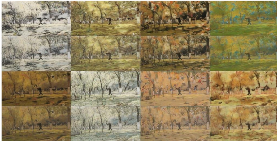
Fig. 3. Synthetic results of nature photos and famous Chinese paintings

In addition, since the evaluation criteria of the synthesized results are subjective evaluations, 10 different people were found to conduct subjective evaluations on the result shown in Figure 3. in this experiment. The evaluation results are shown in Table 1. It can be seen that the method in this paper has certain optimization effect on the synthesis result of Chinese painting as a style image.