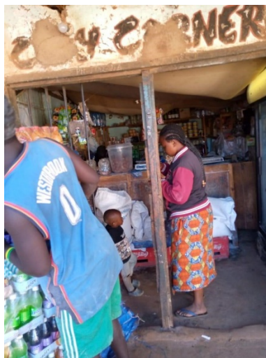
Figure 3 Corner store

A majority of the entrepreneurs had been entrepreneurs prior to entering the refugee camp. Usually they were engaged in a business before they became refugees. One of them described how he had a restaurant in his home country before coming to the refugee camp. He said: