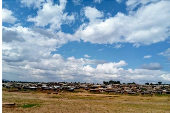
Figure 1 Location of Dzaleka

The UNHCR, the World Food Program (WFP), Churches Action for Relief and Development (CARD), Welt Hunger Hilfe (WHH), World Food Program (WFP), Jesuit Refugee Services (JRS), Plan International Malawi jointly coordinate activities within the camp. A 2019 report from WHH put the population of the camp at 45,095, far outstripping the refugee population in Malawi even the year before.