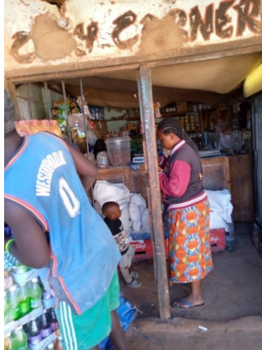
Figure 3 Corner store

A majority of the entrepreneurs had been entrepreneurs prior to entering the refugee camp. Usually they were engaged in a business before they became refugees. One of them described how he had a restaurant in his home country before coming to the refugee camp. He said: