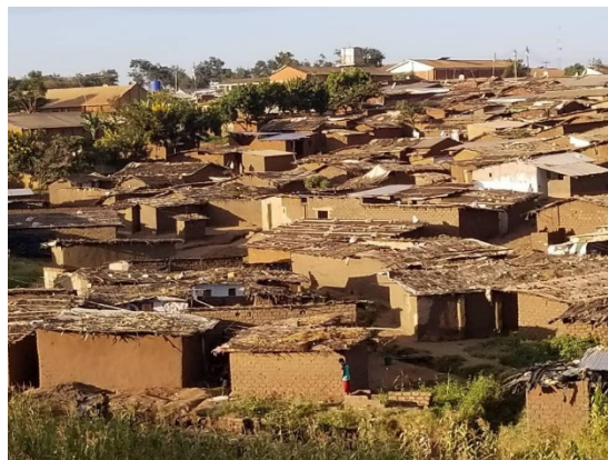
Figure 2 Dwellings in the camp

The Malawi government has made it illegal for refugees to get jobs or conduct businesses outside of the camp. However, Malawi does not restrict conducting business in the camps themselves. These legal barriers have created illegal business activity by the refugees outside of the camp and opportunities within the camp for refugees.