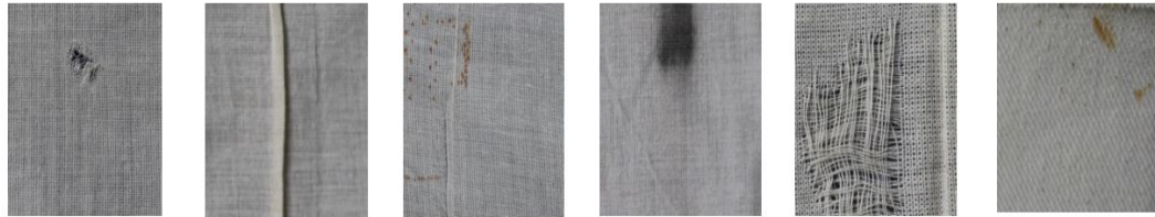
Fig. 1. Dataset (a)Hole (b)Slough (c)Rust (d)Grease (e)Broken Filament (f)Oil Stain

First step in proposed system is to collect fabric material with and without defects used in real factories and capture the images of those fabric materials from different orientations and angles. Then the images should be pre-processed and made to meet the dimensions of 416*416 pixels.