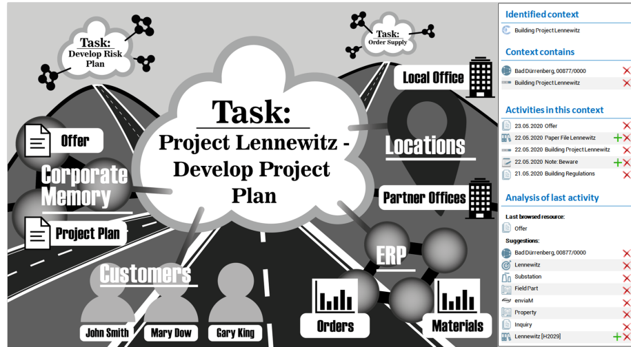
Fig. 1. Vision of a holistic view on a DTO with the cSpaces sidebar providing contextual information from the corporate memory as well as assistance for the resources of a DTO.