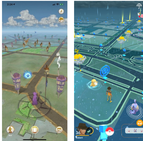
(a) Harry Potter Wizards Unite (b) Pokémon GO