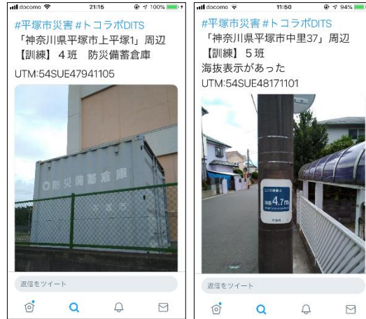
Fig. 3. Examples of the tweet posted by DITS in the town watching