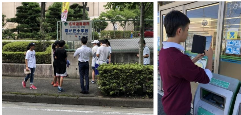
Fig. 2. Tweet posting using DITS in town watching