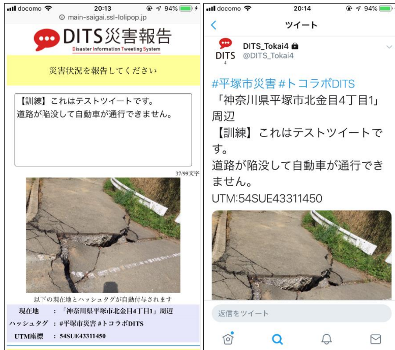
Fig. 1. Tweet posting page of DITS (left) and an example of a tweet posted by DITS (right)