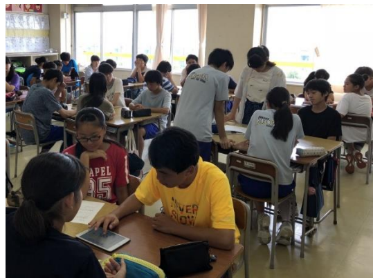
Fig. 4. Group discussion using DIMS