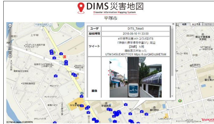
Fig. 5. An example of tweet displaying on DIMS