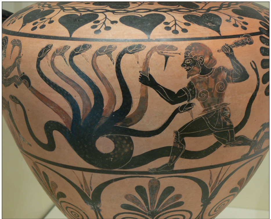
Figure 4: Caeretan hydria, c.525 BC, Hercules slaying the Lernean hydra, Collection of the J. Paul Getty Museum, Malibu, California.

The issue there is thus not so much the existence of legacy as its intrinsic quality and the complexity to integrate it into new developments. Tradeoffs are thus of the essence when reusing legacy code.