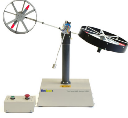
Fig. 1. TRMS 33-220 twin rotor MIMO system

A simulation on a twin rotor system is implemented. The twin rotor system (TRMS 33-220 platform) model can be represented in the following form [28]: