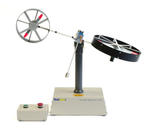
Fig. 1. TRMS 33-220 twin rotor MIMO system

A simulation on a twin rotor system is implemented. The twin rotor system (TRMS 33-220 platform) model can be represented in the following form [28]: