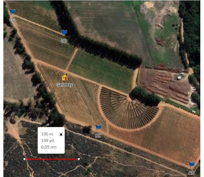
Fig. 2. Node placement in the vineyard.

The gateway node was installed and activated first, after which the remaining nodes were enabled one by one. After a node is powered on, it waits for a GPS lock to synchronise the onboard RTC. Once the RTC is initialised, nodes will start the route discovery process. In each global transmission slot (global transmission slots are open every 10 seconds), each node is given a 20% chance to send an RREQ, if no routes to the gateway node are known, otherwise, if at least one route to the gateway is known, the edge nodes will listen in the global transmission slot. This is to reduce congestion at the start of