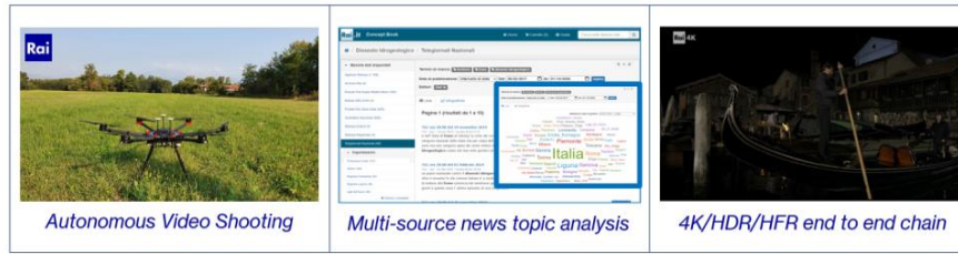
Fig. 3. AI4Media aims to empower the whole news production process: from news analysis to high-quality and impactful content creation.

Results of AI4Media are expected to bring benefit along the whole value chain, including journalists, editorial staff, TV production, rights and privacy management departments, as well as media researchers. Finally, to the audience, who will enjoy always new, modern, original and high-quality content.