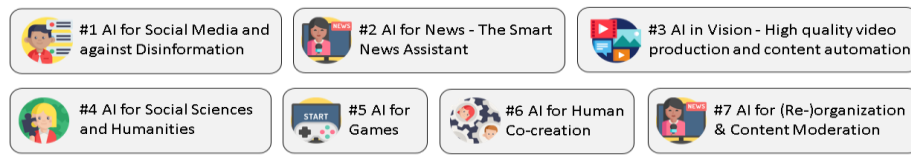
Fig. 1. The AI4Media use cases.

The use cases deal with a broad range of media processes that will be optimized and enhanced by the application of state-of-the-art AI technologies. The industry partners gather a set of user requirements for new AI functionalities with a view to upgrade available tools already used by the media sector with AI features developed by the project (see section 2). In the following, we present the seven use cases.