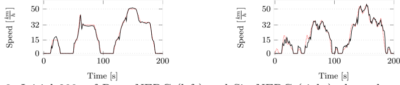
Fig. 3. Initial 200s of PowerNEDC (left) and SineNEDC (right) planned test cycles (red, dotted) and actually driven (black).

NEDC but slightly deviates from it by enforcing higher accelerations ( 1.5 \frac{m}{s^2} instead of 0.94 \frac{m}{s^2} ) after 56s, 251s, 446s and 641s. The maximum input deviation from NEDC is \kappa_I = 10 \text{ km/h} . SINENEDC is defined as the NEDC superimposed by a sine curve, formally \text{SINENEDC}(t) = \max\{0, \text{NEDC}(t) + 5 \sin(0.5t)\} , with a maximum input deviation from NEDC of \kappa_I = 5 \text{ km/h} .