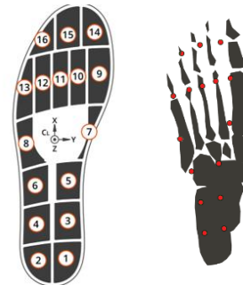
Figure 1 Pressure sensors and contact points repartition

The biomechanical model was composed of 17 rigid segments linked by 16 joints corresponding to 39 degrees of freedom. The geometric parameters were calibrated to each subject from motion data. The inertial parameters were retrieved from anthropometric tables. Joint coordinates were computed using multibody kinematic optimization. Based on the method reported in Fluit et al. (2014), the GRF&M were estimated using an optimization approach considering a set of 16 discrete contact points per foot at the centre of each pressure cell (Figure 1). At each frame, a Sequential Quadratic Programming method estimated the external forces distribution on each active contact point by minimizing the quadratic sum of external forces while respecting the whole-body dynamics equilibrium.