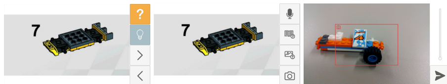
Fig. 1. Left: the assembly instructions are shown with a minimal navigation interface that allows to go to the next/previous step, give feedback on the current step, and get additional help. Middle: The feedback menu allows to record audio, to flag an unclear description or an unclear picture, and to activate the camera with zoom (right).

visual output and touch input and their impact on the perceived workload. Visualizing assembly instructions on a screen, for example, is robust and straightforward, yet cumbersome for the worker if the assembly area is large and she has to carry the tablet with her, for example. Moving the visualization to an AR headset is promising as it allows the worker to look at the instructions at all times if needed. The instructions can also be laid over the real-world components to provide an even more seamless experience [1]. Our goal is to provide a robust touch input surface with basic control of the worker’s interface.