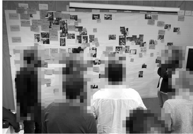
Fig. 3. Workshop participants discussing the experience map.

Based on the collected data, the UX team developed a timeline experience-map presenting activities and interactions between workers, as well as challenges and opportunities for new technology. The workers were invited for a co-creation session (same people that was shadowed), where they were encouraged to further refine the experience-map (Fig. 3).