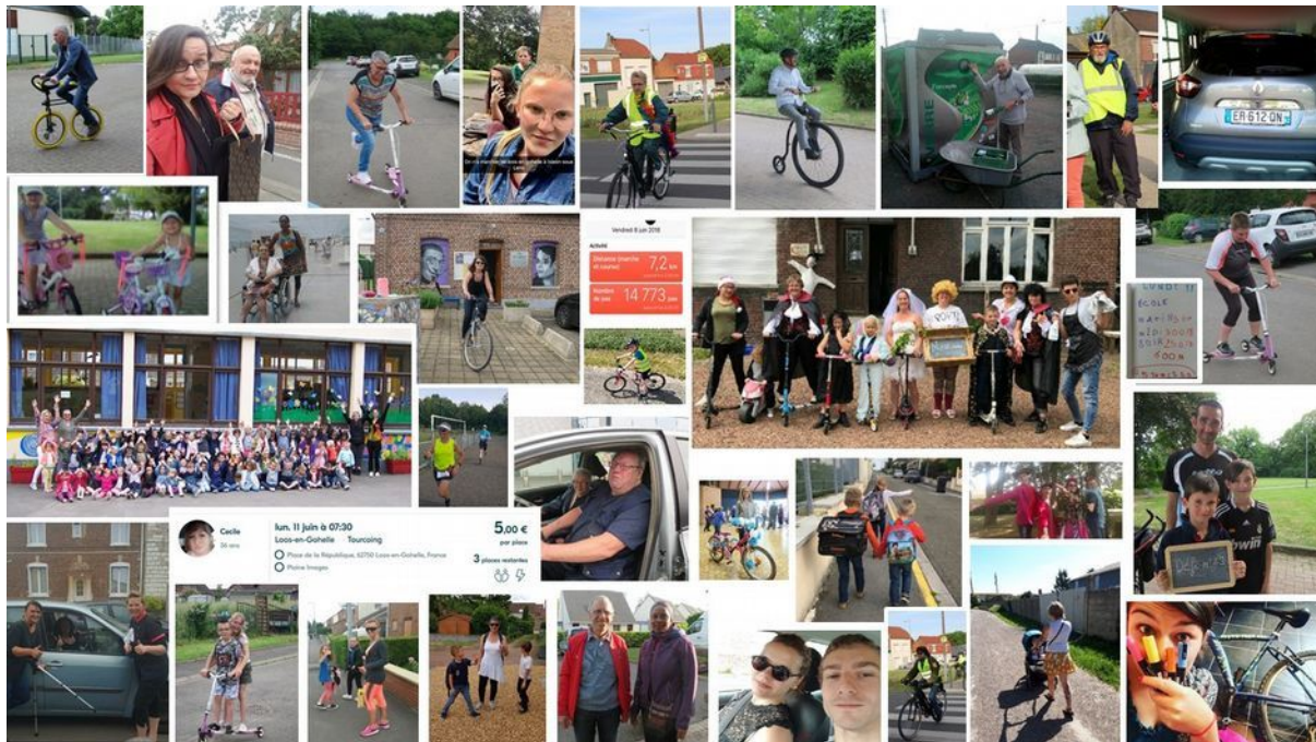
Figure 3: Examples of pictures sent by the participants once they had completed their challenge(s) in the MobiLoos Challenge