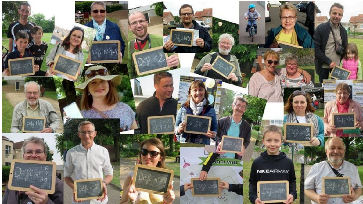
Figure 2: People engaged in the MobiLoos Challenge photographed with the number of their chosen challenge(s)