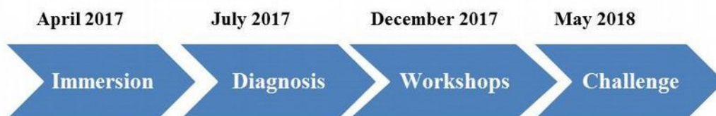
Figure 1: Four methodological protocol periods

goal of supporting changes in daily mobility practices.