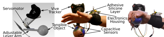
Fig. 1. The WeATaViX interface - From Left to Right: CAD assembly, disengaged device (free hand), engaged device (user grasps a virtual object)

The WeATaViX[1] is a novel wearable 1-DoF device capable of bringing a tangible object in and out of contact with a user’s hand as needed to render making and breaking of contact between a user’s virtual hand and virtual object, as well as grasp and release interactions in immersive VR (see Fig. 1). It consists of a 3D printed base attached to the back of the user’s hand using an adhesive silicone layer, which holds a HTC Vive tracker as well as a servomotor armature. The servomotor actuates an arm supporting the tangible object (in this case, a sphere) equipped with capacitive sensors allowing grasp detection. Movements of the user’s hand are reproduced onto the virtual hand thanks to information from the mounted tracker, while the user views the virtual environment through an HTC Vive VR headset. The device is designed with wearability in mind, weighing under 90g without the tracker, and keeping the palm and fingers completely free of any straps thanks to the adhesive silicone fixation. The silicone layer is capable of securely attaching the device during prolonged use (>45 min) and throughout multiple attaching/detaching cycles (>30).