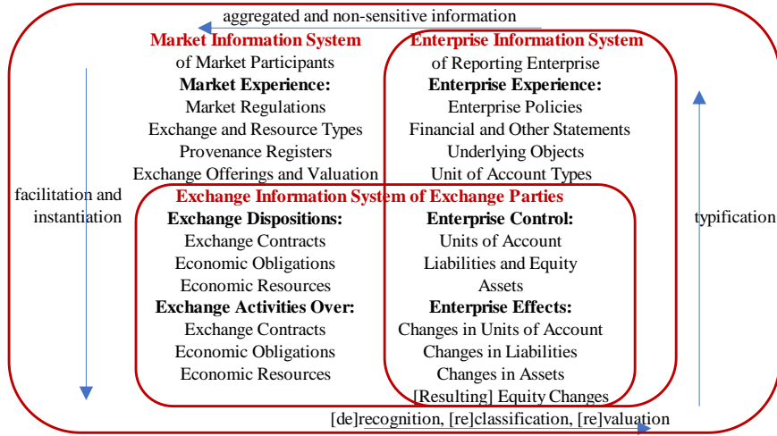
Fig. 3. Market, Exchange, and Enterprise Shared Information Systems.

The information in Enterprise Financial Reporting IS is Enterprise-Specific and interpreted per Financial Reporting Standards, Enterprise's Restrictions, Business Model, Policies, Capabilities, Intentions, and generally is neither correlative nor consensual with other Market Participant information. Current FR Standards neither require the capture of a full lifecycle of an economic exchange, nor object provenance, in a systematic way. Instead of capturing information about transactions and events, conventional accounting recognizes, classifies, and values prescribed transaction and other event effects in assets, liabilities and equity [4].