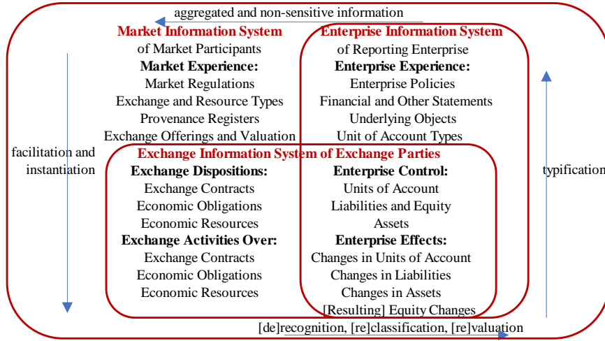
Fig. 3. Market, Exchange, and Enterprise Shared Information Systems.

The information in Enterprise Financial Reporting IS is Enterprise-Specific and interpreted per Financial Reporting Standards, Enterprise's Restrictions, Business Model, Policies, Capabilities, Intentions, and generally is neither correlative nor consensual with other Market Participant information. Current FR Standards neither require the capture of a full lifecycle of an economic exchange, nor object provenance, in a systematic way. Instead of capturing information about transactions and events, conventional accounting recognizes, classifies, and values prescribed transaction and other event effects in assets, liabilities and equity [4].