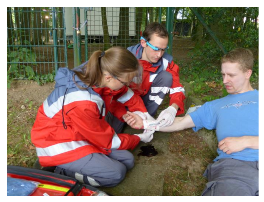
Fig. 5. Triage of a casualty with a heavy bleeding. The user wearing smartglasses helps applying a pressure dressing [46].