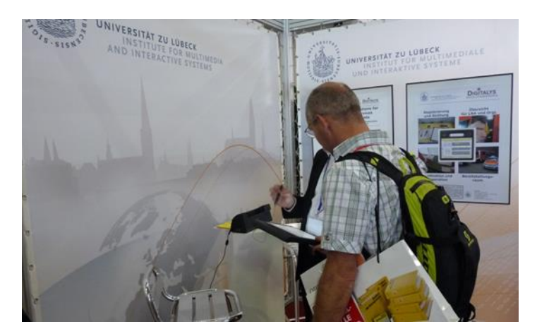
Fig. 3. Discussing the prototype at the emergency and rescue fair "akut 2012"(left)