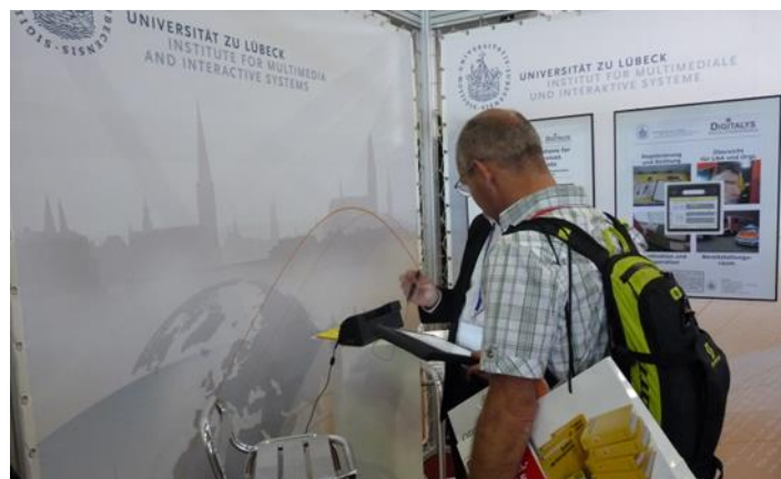
Fig. 3. Discussing the prototype at the emergency and rescue fair "akut 2012"(left)