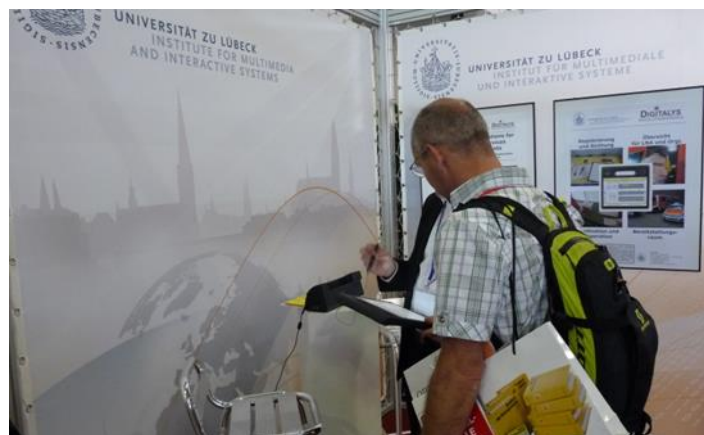
Fig. 3. Discussing the prototype at the emergency and rescue fair "akut 2012"(left)