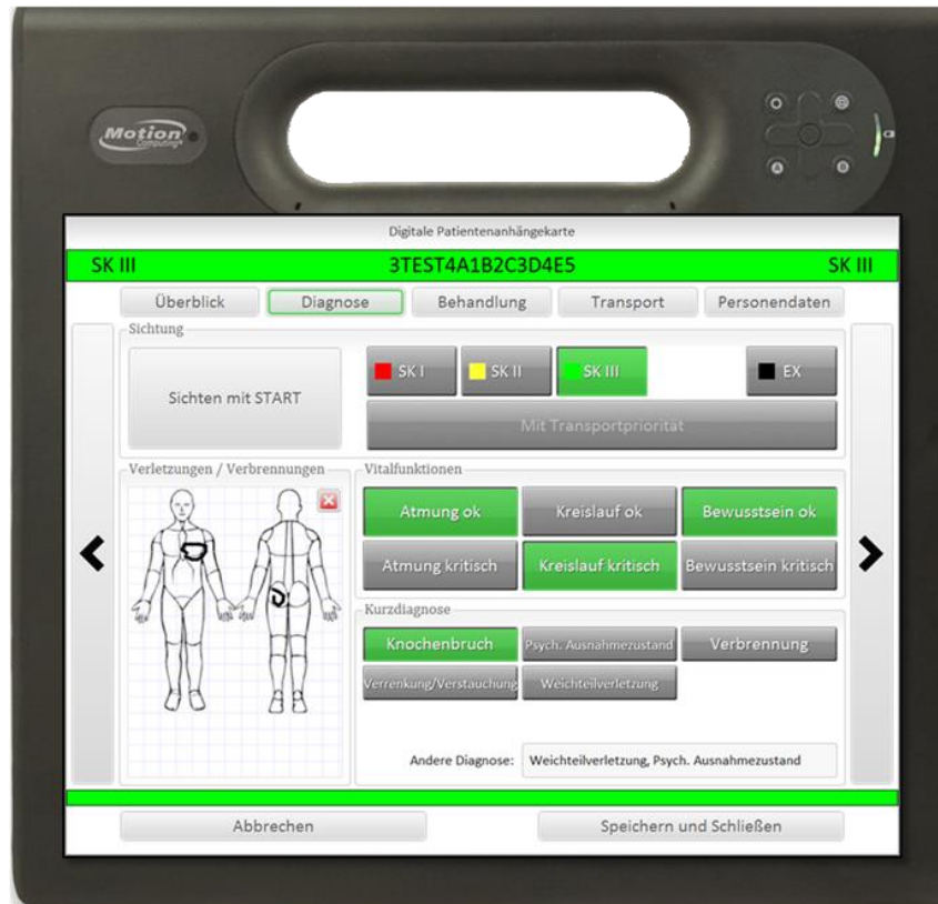
Fig. 1. Button-oriented design offering a choice of valid input values

which “enabled us to better match our conceptual model with their mental model beyond the use cases associated with the actual chart” [35].