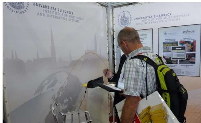
Fig. 3. Discussing the prototype at the emergency and rescue fair "akut 2012"(left)