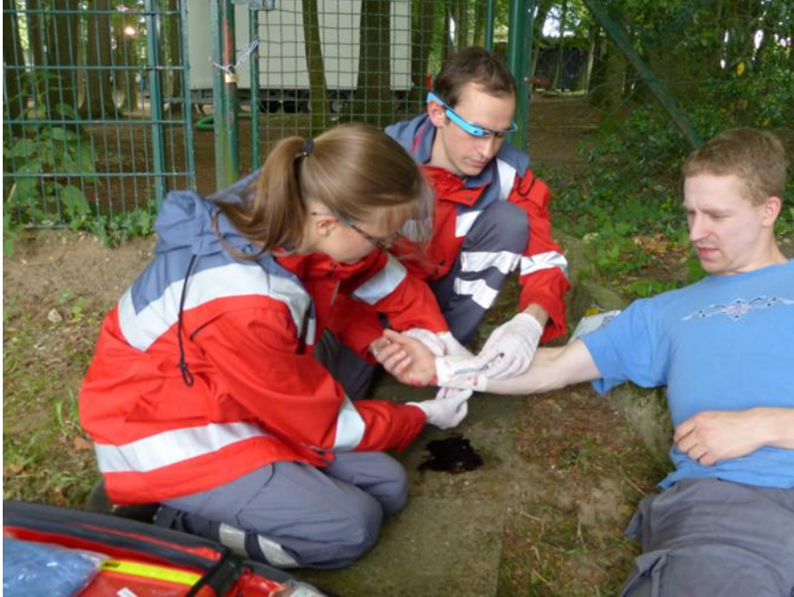
Fig. 5. Triage of a casualty with a heavy bleeding. The user wearing smartglasses helps applying a pressure dressing [46].