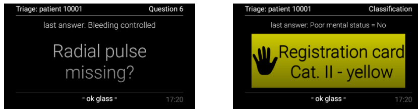
Fig. 4. Instructions and questions are shown to the user interacting via voice commands.

Before coding, mockups were designed and evaluated with usability and domain experts. Subsequently, two versions of the application with different interface and interaction design were implemented. One of them had to be discarded quickly because of technological flaws and not being consistent with design principles of Google. The other one was implemented iteratively (see Fig. 4).