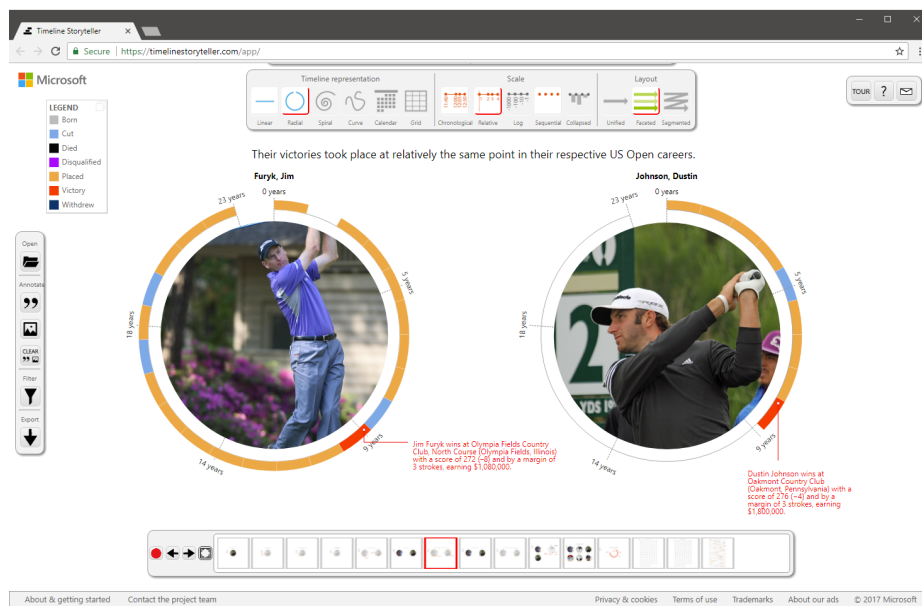
Fig. 3: Timeline Storyteller enables people to create a scene-based story, presenting different aspects of timeline data using a palette of timeline representations, scales, and layouts. It provides people with controls for filtering, highlighting, and annotation.

Researchers have also developed authoring tools to enable people with little or no programming skills to create a narrative visualization that supports interactions and animations. Ellipsis helps storytellers generate narrative visualization using templates with a domain-specific language (DSL) and a graphical user interface [39]. TimeLineCurator automatically extracts temporal events from freeform text and enables people to interactively curate the events, helping them easily generate a linear timeline [18]. DataClips is an authoring tool that helps non-experts create data videos [2]. Timeline Storyteller (Figure 3) allows people to present different aspects of timeline data such as chronology, sequence and the periodicity of events using a palette of timeline representations, scales, and layouts, along with controls for filtering and annotation [10].