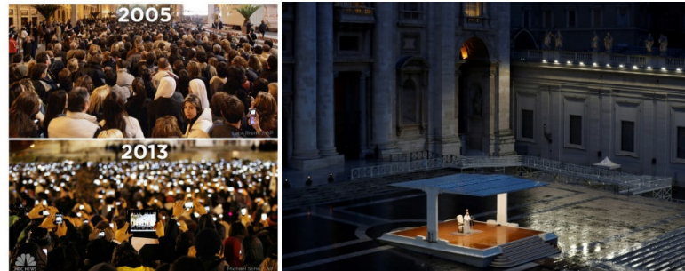
Fig. 3. Demonstration of changes in the last 15 years following the Pope with audiences in 2005, 2013 and without audience in 2020

Since the introduction of social media and its rise since 1995 digitalization has changed the world. Figure 3 shows a comparison of the impact of such trends using the Pope as an example. While in 2005 usage of smart phones was very limited, the pictures for 2013 speak a different language, showing the uptake of social media. Today the pope is having the most influential twitter account in the religious world (@Pontifex, @Pontifex_es and @Pontifex_it), and as the picture in Figure 3 right-side shows, this has become key to reach followers, given the limitations in personal interaction in 2020.