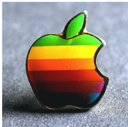
Fig. 1. Apple lapel, badge (1982).