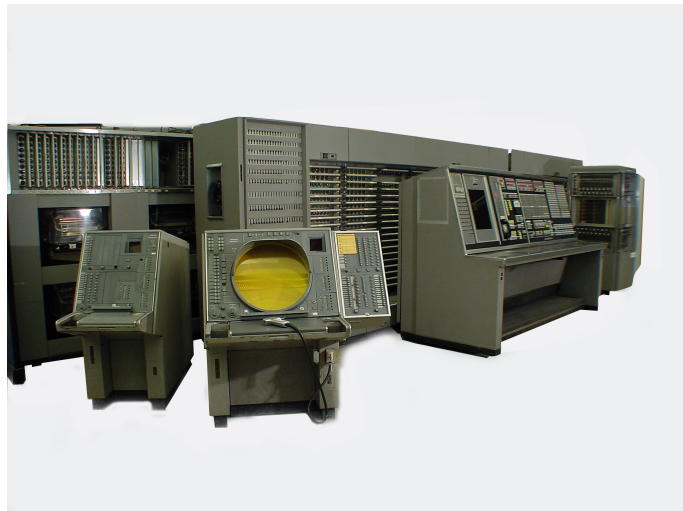
Fig. 3. SAGE Console (1960)

Another selective reduction was to acquire control consoles which straddled technological and cultural meanings. SAGE, a radar command and control air defence system, built in the US, in response to the threat of Soviet nuclear attack during the Cold War is an example. In cultural terms the sober grimness of its consoles, a small fraction of this vast system, conveys vigilance, the seriousness of the threat it was intended to neutralize, and the high stakes of Cold War tensions [figure 3].