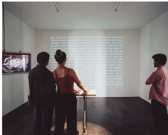
Fig. 4. Poetry Machine by David Link. Picture credit: David Link

Two areas come to mind where running software might be thought to be indispensable to meaning. The first is computer games. Gaming has significantly driven innovation and it is questionable whether the preservation of only the physical paraphernalia of gaming can meaningfully replace the ability to run these programs live on contemporary platforms [20]. A second example is that of art installations. Computer-enabled or computer-dependent art installations are largely meaningless unless run live. David Link’s Poetry Machine and his self-regenerating book, Meditationes , are examples [21, 22, 23, 24] [figure 4].