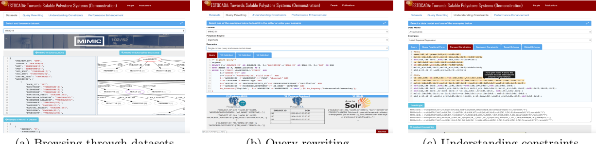
(a) Browsing through datasets