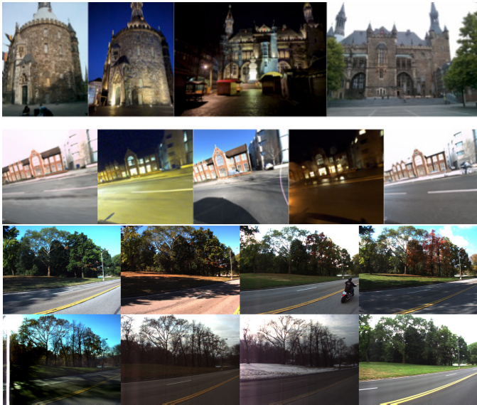
Fig. 2. Example query images for Aachen Day-Night (top), RobotCar Seasons (middle) and the Extended CMU Seasons (bottom) datasets.

Ground truth for night-time queries. We captured 98 night-time query images using a Google Nexus5X phone with software HDR enabled. Attempts to include them in the intermediate model resulted in highly inaccurate camera poses due to a lack of sufficient feature matches. To obtain ground truth poses for the night-time queries, we thus hand-labelled 2D-3D matches. We manually selected a day-time query image taken from a similar viewpoint for each night-time query. For each selected day-time query, we projected its visible 3D points from the intermediate model into it. Given these projections as reference, we manually labelled 10 to 30 corresponding pixel positions in the night-time query. Using the resulting 2D-3D matches and the known intrinsics of the camera, we estimate the camera poses using a 3-point solver [27], [38] and non-linear pose refinement.