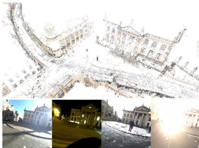
Fig. 1. Visual localization in changing urban conditions. We present three new datasets, Aachen Day-Night , RobotCar Seasons (shown) and Extended CMU Seasons for evaluating 6DOF localization against a prior 3D map (top) using registered query images taken from a wide variety of conditions (bottom), including day-night variation, weather, and seasonal changes over long periods of time.

Capturing a scene under all viewing conditions is prohibitive. Thus, the assumption that all relevant conditions are covered is too restrictive in practice. It is more realistic to expect that images of a scene are taken under a single or a few conditions. To be practically relevant, e.g. , for life-long localization for self-driving