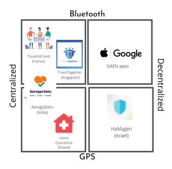
Figure 1: Classification of analyzed applications