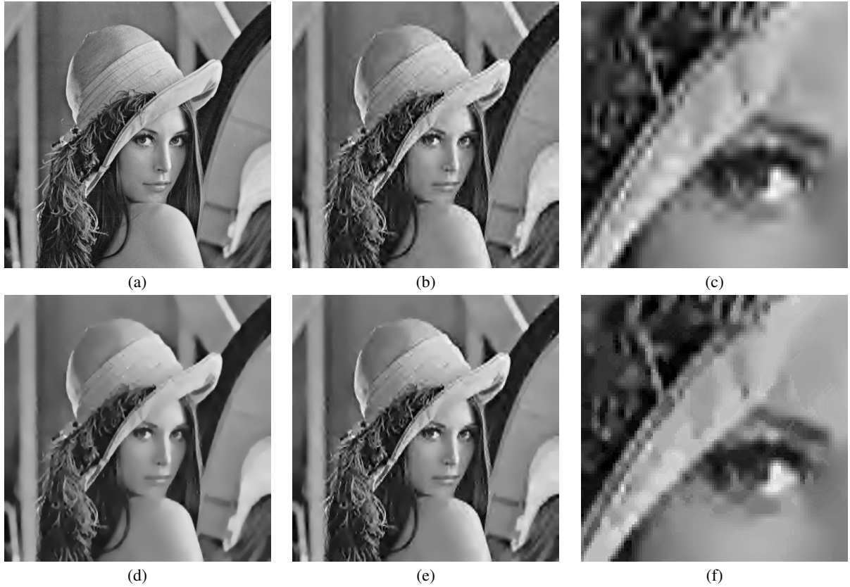
Fig. 3. a: original image - b: decoded image (0.085bpp) - c: detail of b - d: denoised using \mu = 1.5 - e: denoised and enhanced - f: detail of e