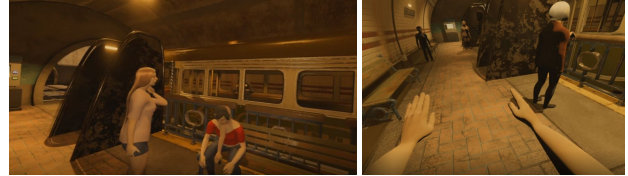
Figure 1: Left: Virtual environment representing a subway gate and populated with persons having three arms. Right: First-person perspective on user’s only two arms.

In this demonstration, users will need to control a third arm prosthesis. In the literature, there exist a number of works that have already explored and evaluated the control of additional arms. For example, in a virtual reality context, Laha et al. [1] proposed and evaluated three different methods to control a third arm (bimanual, unimanual, and head-control). Another interesting example is the work from Steptoe et al. [4] which studied embodiment within an avatar having a tail (hip control). Finally, in a real-world context, Saraji et al. [3] proposed a robotic system composed of two robotic arms attached to users’ back and controlled thanks to the feet and the knees. Parietti et al. [2] propose a similar robotic system with a different approach to control, where the robot autonomously adjusts its state based on interaction positions and forces and a model of the