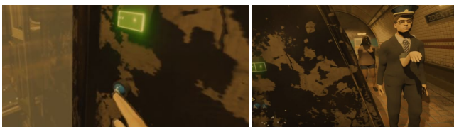
Figure 3: The call for help. Left: User's hand reaching for the help button. Right: Security officer coming to activate the automatic opening.

For the next task, users must cross the gate, once again designed for tri-manual operation (see Figure 2 right). The transportation card must be maintained on the card reader, unlocking both doors that can then be individually pushed. Two-armed users will only be able to push one door, creating an opening too narrow for them to go through. Consequently, this task is impossible to achieve. Users can