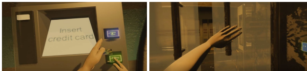
Figure 2: The main tasks to perform in the virtual environment. Left: Reloading the transport card on a dedicated machine. Right: Crossing the gate by opening its doors in order to enter the subway carriage.

Users need to reload their transport card at the ticket machine before entering the subway (see Figure 2 left). The particularity of this task is that the ticket machine is designed in such a way that users have to hold both their transportation card and their credit card up against the respective card readers, all the while pressing another button to make the adequate selections. Once the selection is made, the presence of the credit card against the reader triggers the payment and order confirmation. If the order is not confirmed in time, it is canceled and users must repeat the process. As a three-armed user, each hand can perform a sub-task (holding one of the cards against a reader, pressing the button) simultaneously so as to easily achieve the task. Since the ticket machine interface expects such users, the countdown before cancellation is quite short. Therefore, the task is achievable as a two-armed user but proves very difficult. Failures cause frustration to users, amplified by background sounds of discontent from other people waiting in line to use the machine. Once the card is recharged, users can move to the train access gates.