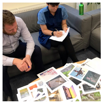
Figure 3: Example of Dialogue-Lab activities from the author's research [10]