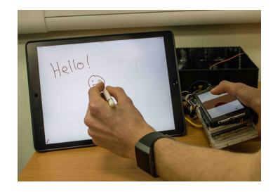
Figure 2: Mobile canvas prototype using hydrogels to simulate paints [14]