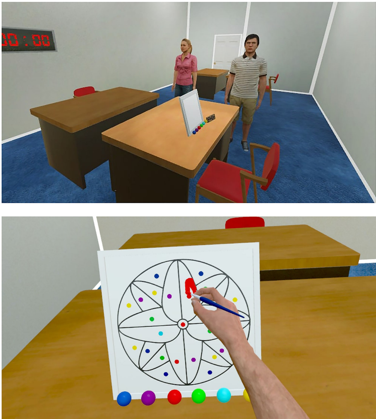
FIGURE 1 | The virtual environment from the first-person perspective during the task (Left), and general overview of the environment with the two avatars (Right).

in the same way by right- and left-handed participants (see the accompanying video 4 ).