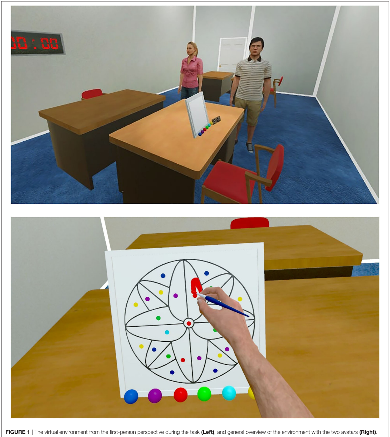
FIGURE 1 | The virtual environment from the first-person perspective during the task (Left), and general overview of the environment with the two avatars (Right).

in the same way by right- and left-handed participants (see the accompanying video 4 ).