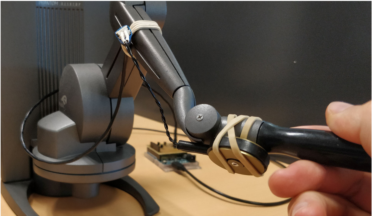
FIGURE 2 | Experimental setup: Phantom Desktop close-up, with the tacter fitted to the stylus, and the Arduino Leonardo in background.

using any color. The degree of precision was measured as the ratio of pixels correctly colored and the total number of pixels colored. The total number of pixels correctly colored was computed by counting for each zone the number of pixels colored using the appropriate color. To compute these two values, only the zones inside the circle were used.