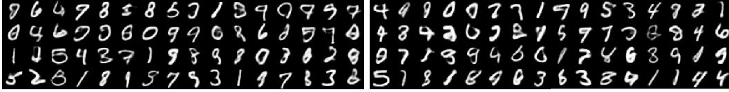
Figure 2: Quantitative result of Langevin VAE in comparison with HVAE. Left sub-figures are generated samples of HVAE. Right are samples of Langevin-VAE. In both methods, the number of steps in the flow computation is K = 5 .

Following the classical VAE approach (Kingma & Welling, 2014), the encoder network parameterized by \omega_E outputs multivariate Gaussian parameters: \mu_{\omega_E}(x) \in \mathbb{R}^\zeta and \Sigma_{\omega_E}(x) \in \mathbb{R}^{\zeta \times \zeta} , such that the variational prior is a multivariate Gaussian q_{\omega_E}^0(\phi_0|x) = \mathcal{N}(\phi_0|\mu_{\omega_E}(x), \Sigma_{\omega_E}(x)) with diagonal covariance matrix. This choice obviously makes the reparameterization trick feasible to estimate the lower bound. The related graphical model of the quasi-symplectic Langevin VAE is displayed in Fig. 1.