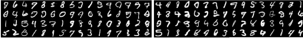
Figure 2: Quantitative result of Langevin VAE in comparison with HVAE. Left sub-figures are generated samples of HVAE. Right are samples of Langevin-VAE. In both methods, the number of steps in the flow computation is K = 5 .

Following the classical VAE approach (Kingma & Welling, 2014), the encoder network parameterized by \omega_E outputs multivariate Gaussian parameters: \mu_{\omega_E}(x) \in \mathbb{R}^\zeta and \Sigma_{\omega_E}(x) \in \mathbb{R}^{\zeta \times \zeta} , such that the variational prior is a multivariate Gaussian q_{\omega_E}^0(\phi_0|x) = \mathcal{N}(\phi_0|\mu_{\omega_E}(x), \Sigma_{\omega_E}(x)) with diagonal covariance matrix. This choice obviously makes the reparameterization trick feasible to estimate the lower bound. The related graphical model of the quasi-symplectic Langevin VAE is displayed in Fig. 1.