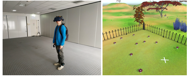
Figure 2: Left: Setup in the physical environment. The HTC Vive with a wireless adapter was used to enable participants to physically walk in an 8mx8m area. The tracking of the user’s motions was enabled by the two hand controllers and two HTC Vive Trackers attached to their ankles. Two additional HTC Vive trackers were also positioned on a backpack to track participants’ shoulders. Tracking was done using four HTC Vive lighthouses. Right: Overview of the virtual environment: the navigation area was constrained by the virtual fences which matched the limits of the physical space.

To better understand the influence of the presence of an avatar depending on the locomotion technique, we selected different locomotion techniques based on Boletsis’s taxonomy [8]: room-scale-based, motion-based, controller-based and teleportation-based. In particular, we were interested in techniques that are commonly used in virtual reality, and that involved a similar motion in the VE but different levels of physical movement. Therefore, we chose the following techniques: Real Walking (RW; room-scale-based), Walking-In-Place (WIP; motion-based) and Steering (S; controller-based). Despite its inclusion in Boletsis’s taxonomy, we did not include