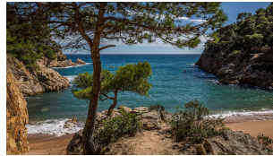
Figure 5.5: Text entity: seashore.n.01

An example of the same entity, la côte (the seashore, seashore.n.01 ), retrieving different results with different thematic keywords.