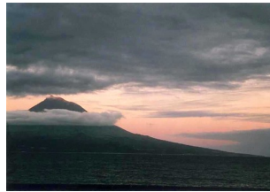
Figure 5.1: Text entity: volcano.n.02 ...des terres modelées par la force tellurique des volcans . Translation: ...land formed by the force of volcanoes .

Accepted image: perfect text+entity synset match