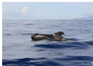
Figure 5.2: Text entity: whale.n.02 ...des excursions en bateau pour aller saluer les baleines ... Translation: ...boat excursions for whale watching...

Accepted image: partial text+entity synset match