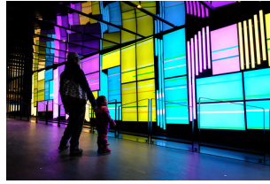
Figure 5.10: Text entity: kaleidoscope.n.02

Montréal est une ville comme un kaléidoscope , enrichie par un étonnant mariage de communautés.