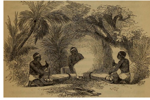
Figure 5.7: Text entity: mouthpiece.n.06

Pas d' embouchure maritime : le fleuve se déverse dans le désert même.