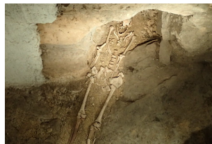
Figure 5.8: Text entity: cellar.n.03

Examples of false negatives where the text's ambiguity caused a bad perfect match.