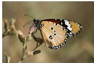
Figure 5.9: Text entity: bow_tie.n.01

Examples of a false negative where the text's ambiguity caused a mismatch between the text entity and image entity.