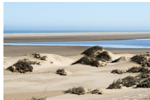
Figure 5.6: Text entity: seashore.n.01