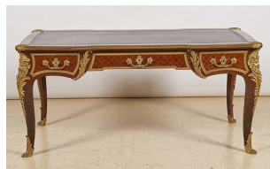
Figure 5.3: Text entity: table.n.02 Enfin, vous trouverez aussi plutôt facilement une bonne table aux tarifs raisonnables à Brest.

Rejected image: partial text+entity synset match