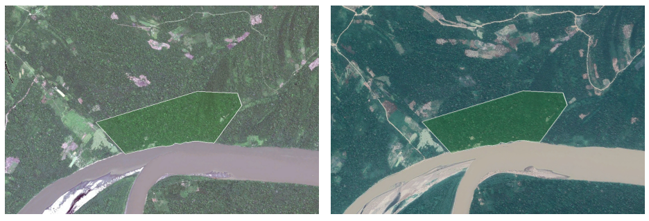
(a) September 15, 2015