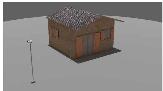
Fig. 1: 3D scene involving a wood house and an infrared camera that can be loaded by the software.

Where V_{kj} represents the visibility between the element k and element j , F_{k \rightarrow j} is the form factor that characterizes the exchange between the surface k and j and \epsilon_{k,\Delta\lambda_i} is the emissivity of the surface k in the band \Delta\lambda_i . The progressive radiosity algorithm has been implemented in C++ by taking advantage of the latest graphical libraries and parallelized through a GPGPU (General-purpose processing on graphics processing units) approach.