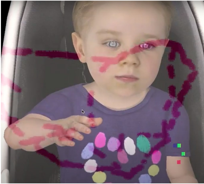
Fig. 1. BabyX drawing on a virtual touch screen.