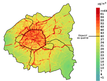
Fig. 2. Areas affected by air pollution.

Another example of prescriptive studies concern the correlation between air pollution and respiratory illnesses [19]. The research findings come from data belonging to different domains such as 1) prescriptive data conditions in health information systems, 2) the air quality index (AQI) data provided by the World Health Organization (WHO), and 3) the descriptive data coming from particular air pollution electrical sensors. The descriptive data alone, in particular the concentration of microscopic particles with a diameter of 2.5 \mu\text{m} or less, are not sufficient to produce a graphical representation apt to meet the prescriptive aims of the study (see Figure 2), i.e the sustainable development program in urban and rural areas affected by air pollution.