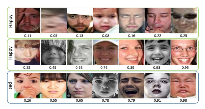
Fig. 3: Training samples from RAF data. The value below the images depicts the sample importance learned by our framework. ( Top row : Noisy annotations for happy class. Low sample importance neglects the effect of noisy inconsistent samples on model learning. Middle and Bottom row : The assigned sample weights for happy and sad class in ascending order.)