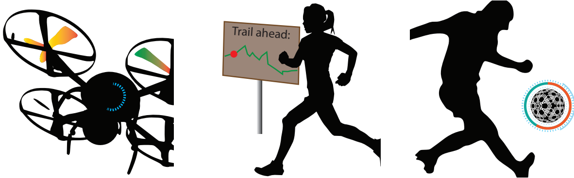
Figure 1: Three examples of visualizations viewed under motion. Left: Visualization of rotor speed and battery level attached to a flying drone. Middle: An athlete running past a sign showing the elevation levels of the trail ahead. Right: A player with an augmented soccer ball

Université Paris-Saclay, CNRS, Inria, LRI, 91405 Orsay, France.