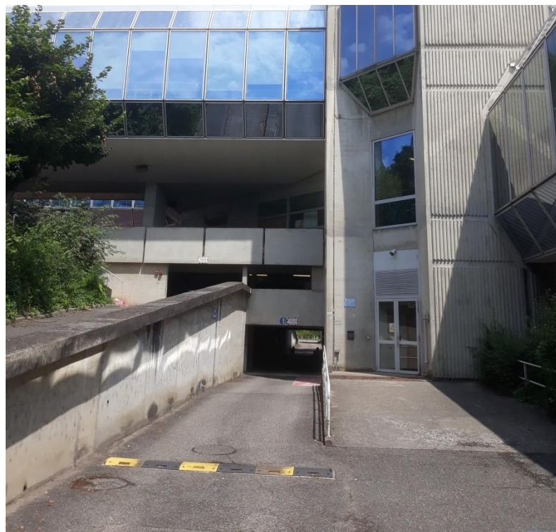
Example of concrete structure environments of underground parking sensors parking in Orange Labs Meylan