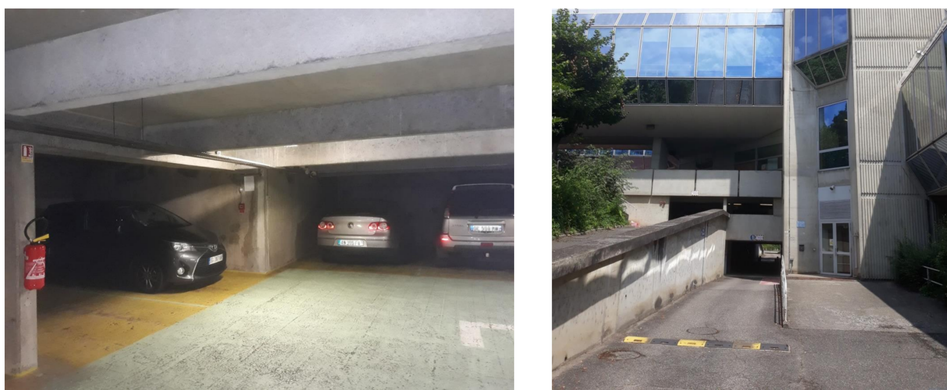
Example of concrete structure environments of underground parking sensors parking in Orange Labs Meylan

https://www.orange-business.com/fr/reseau-iot