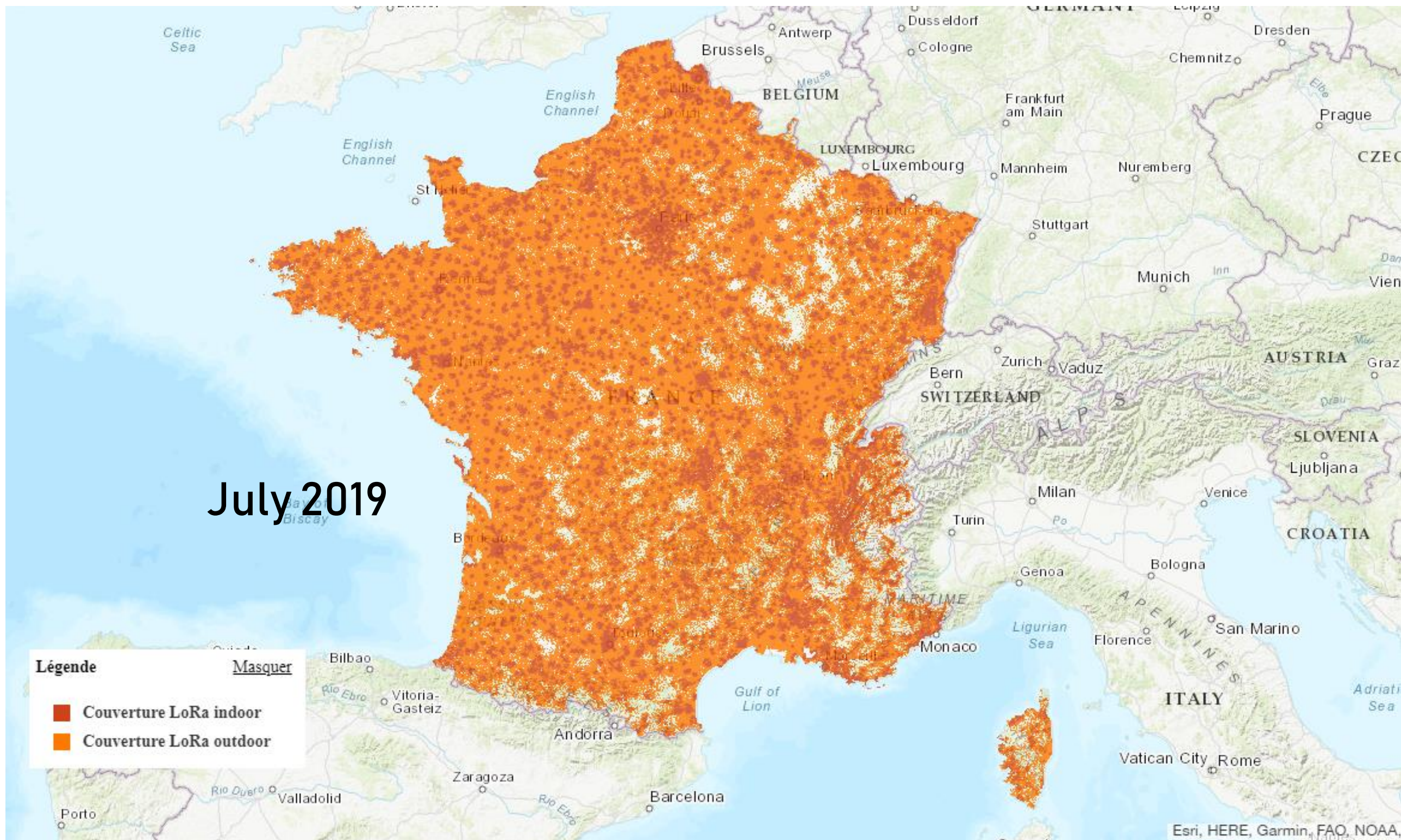
Orange LoRa coverage in France.

https://www.orange-business.com/fr/reseau-iot