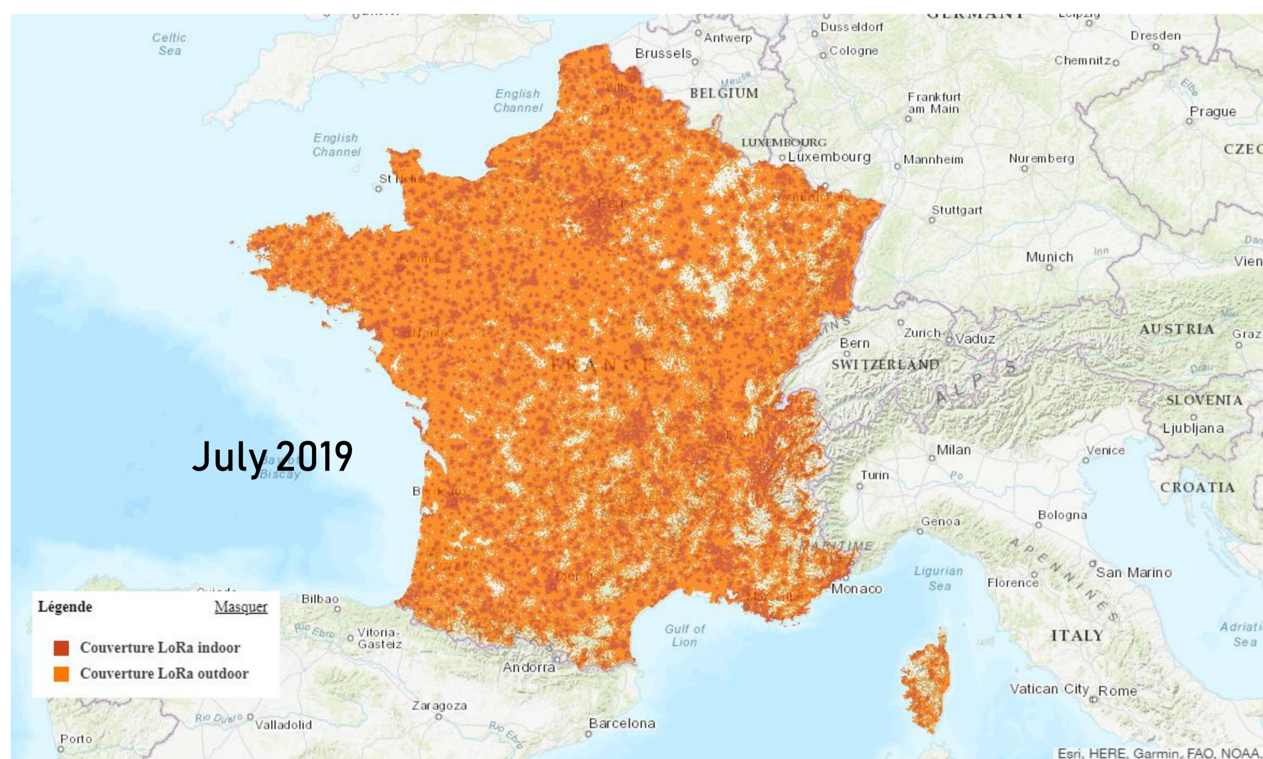
Orange LoRa coverage in France.

https://www.orange-business.com/fr/reseau-iot